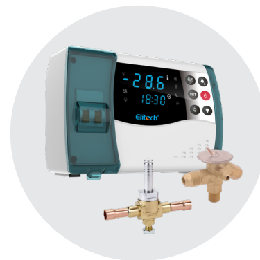
Valve + Control Box