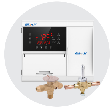
Valve + Control Box